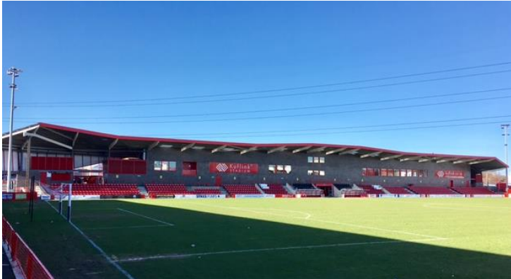
View of the main stand