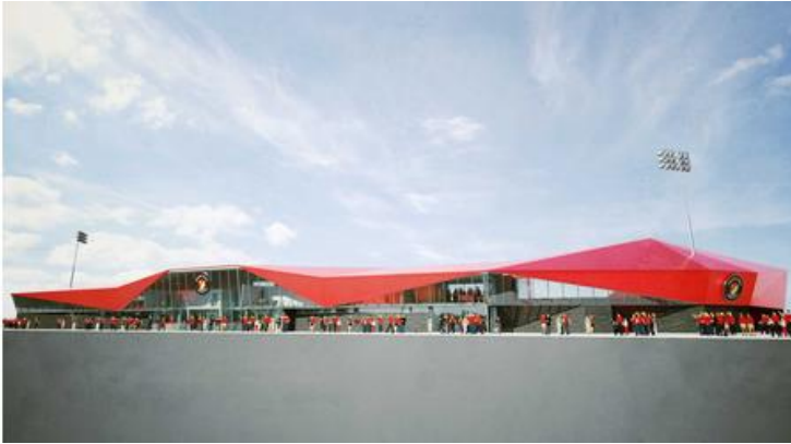
Stonebridge Rd entrance