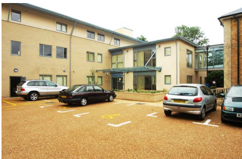
Exterior view showing integration of new and existing buildings