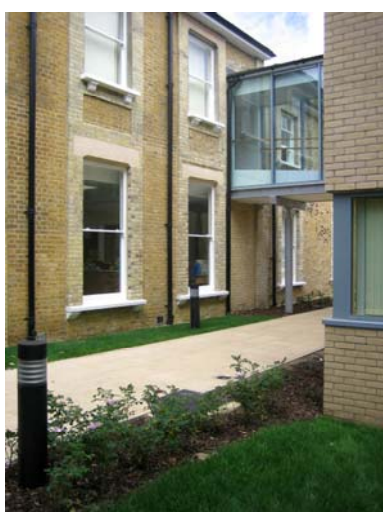
Bridge linking existing and new buildings